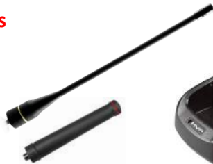
Whip / Stubby Antenna