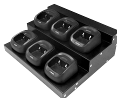
Multi Slot Charger